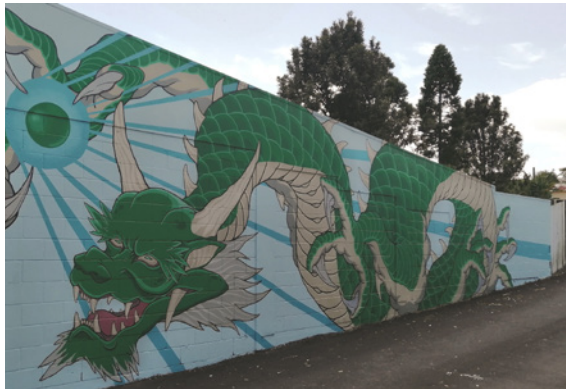
"Chinese Lunar Year of the Wood Dragon 2025"

It is a privilege to work with local artists on our murals and continue to support their work through promotion on our website. The backstories are intriguing and add another dimension to the visual impact on our streets.