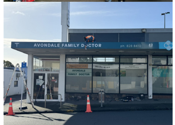
New verandah signs for Bargain King and Avondale Family Doctor