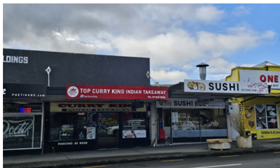
Painting the edges of the Curry King and Sushi Bee verandahs..

It has been a year of change with some long-time businesses moving on, and exciting new businesses moving in. Executive members of the ABA remain active in identifying building stock availability and promoting these spaces to a wide variety of businesses, continually working toward increasing the range of services available to our community.